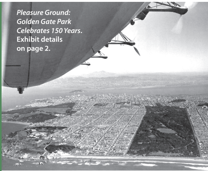
Pleasure Ground: Golden Gate Park Celebrates 150 Years. Exhibit details on page 2.