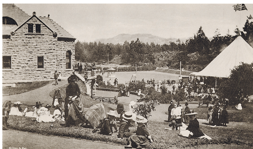
Children's Playground, Golden Gate Park, 1890.

"The Golden Gate Park is almost daily filled with carriages and pedestrians. The San Francisco people are just beginning to discover what a beautiful Park this is, and it is gaining day by day in favor as a popular resort."