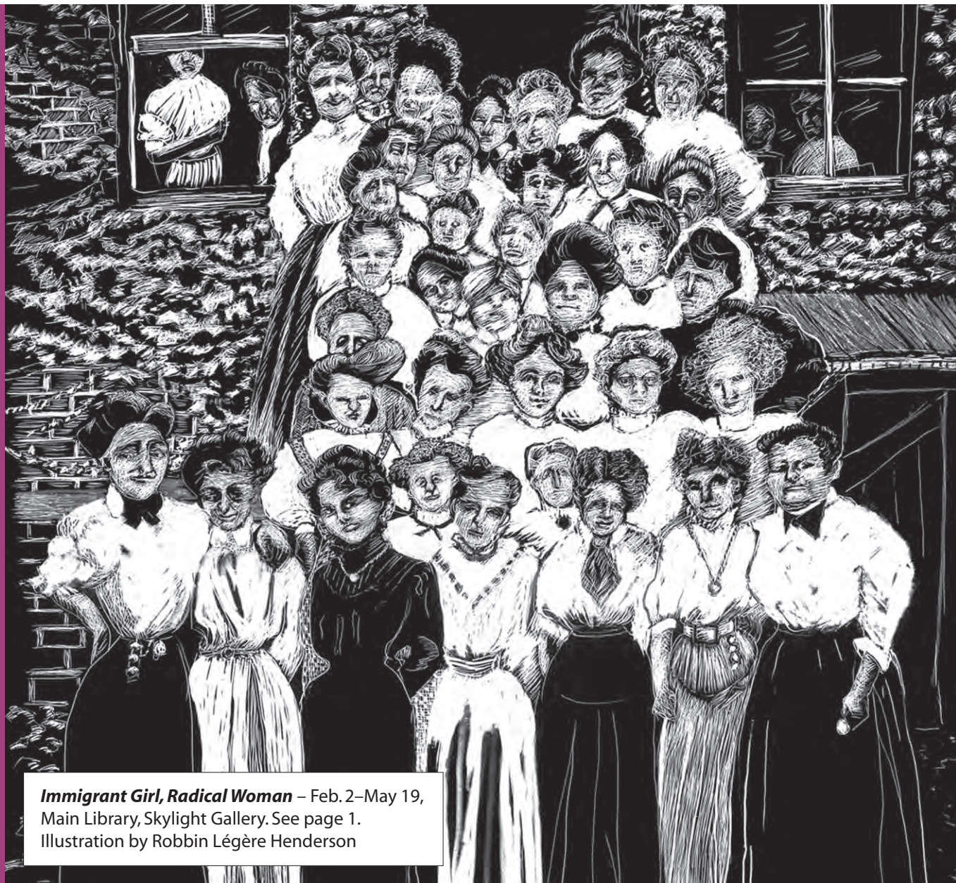
Immigrant Girl, Radical Woman – Feb. 2–May 19, Main Library, Skylight Gallery. See page 1. Illustration by Robbin Légère Henderson

The San Francisco Public Library system is dedicated to free and equal access to information, knowledge, independent learning and the joys of reading for our diverse community.