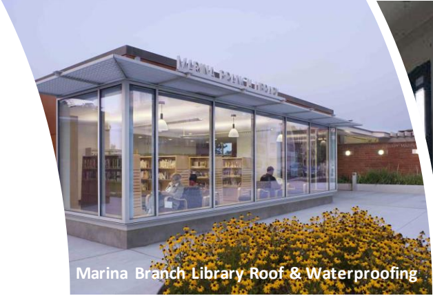
Marina Branch Library Roof & Waterproofing