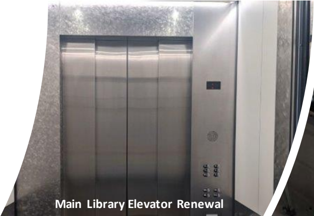
Main Library Elevator Renewal