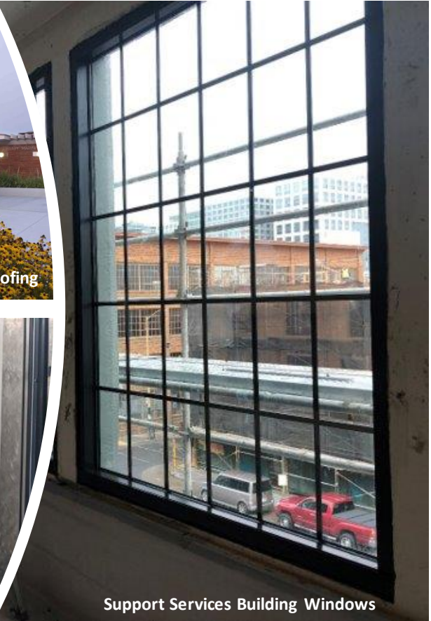
Support Services Building Windows